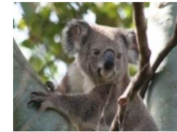
Koala Phascolarctos cinereus

be careful of the bats and spiders as you exit via the Abandoned Mine Shaft!