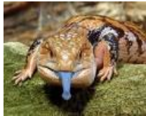
Eastern Blue Tongue