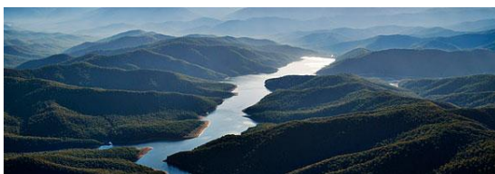
Upper Yarra Dam Melbourne Water

Water Programs are held at locations along the Upper Yarra River and at the Upper Yarra Dam (1957). Students explore water and its journey through time and place. Discover the closed catchments of the Upper Yarra and