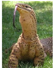
Monitor Lizard - Goanna

Our Education Programs are designed to meet the curriculum needs of each year level and include many cross curriculum priorities and general capabilities. Programs are facilitated at various locations in and around the forests and mountains of Warburton, the Yarra River, its tributaries and at the Indoor Forest. Our aim is to raise ecological understanding thus inspiring respect, connection and a sense of responsibility to our natural world that leads to healthy and informed decisions for a sustainable future.