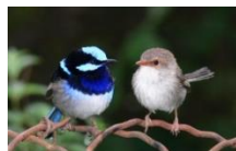
Superb Blue Wren