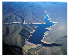
Melbourne Water Upper Yarra Reservoir

Our Education Programs are designed to meet the curriculum needs of each year level and include many cross curriculum priorities and general capabilities. Programs are facilitated at various locations in and around the forests and mountains of Warburton, the Yarra River, its tributaries and at the Indoor Forest. Our aim is to raise ecological understanding thus inspiring respect, connection and a sense of responsibility to our natural world that leads to healthy and informed decisions for a sustainable future.